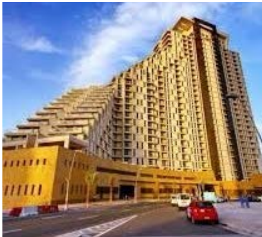
Reem island mangrove building