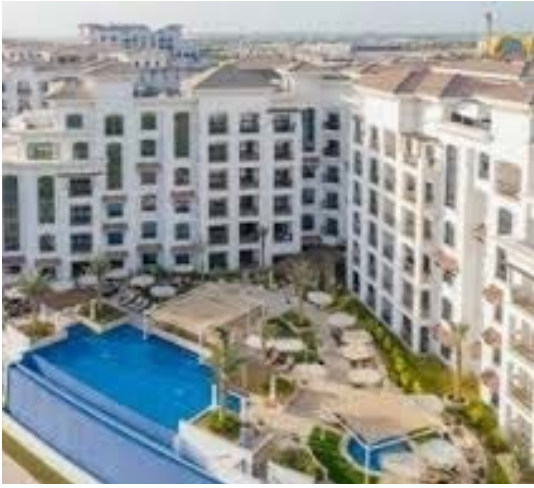
Ansam YAS island