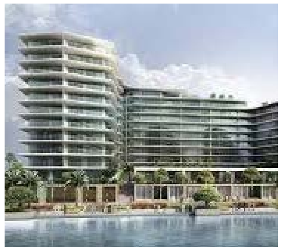
Al Hadeel raha beach