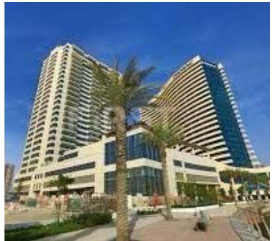
Reem Island Marina bay Damac